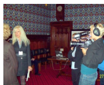
The Event was recorded

Members of the society also attended the event with several staying in London for two nights. Around thirty of our