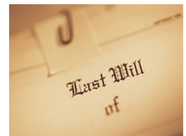
Have you considered a leg-

There are different types of legacies including Residuary Legacies where your estate or percentage of it could be left to the society after all other financial commitments have been paid. A Pecuniary Legacy is a fixed amount that could be granted whilst a Specific Legacy is an item, such as a ring, that could be given. We received one legacy of £5,000 two years ago.